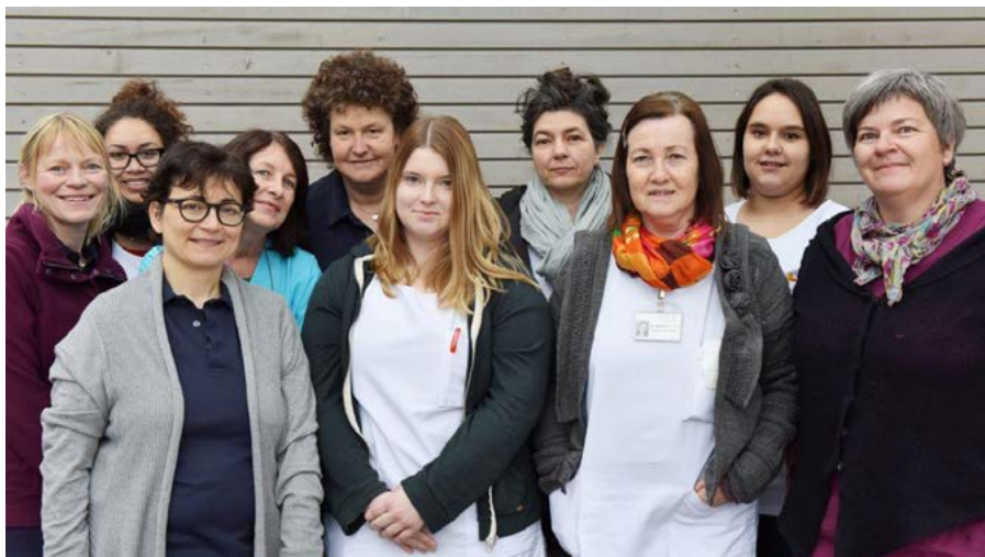
Out-patient clinic team