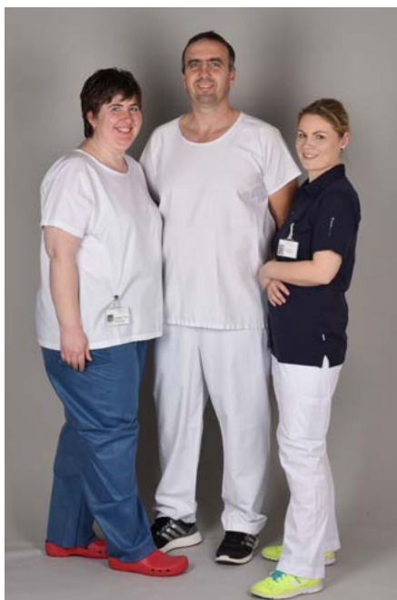
Dermatosurgery nursing team