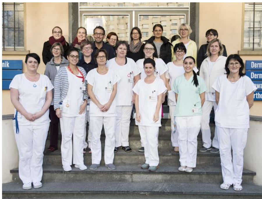
In-patient nursing team