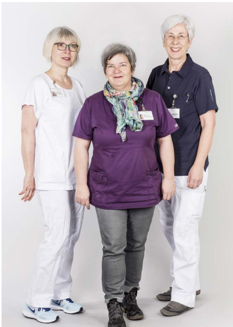
Clinical nurse leaders